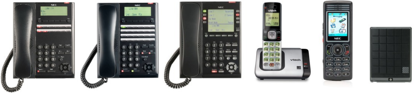
12 Button Phone