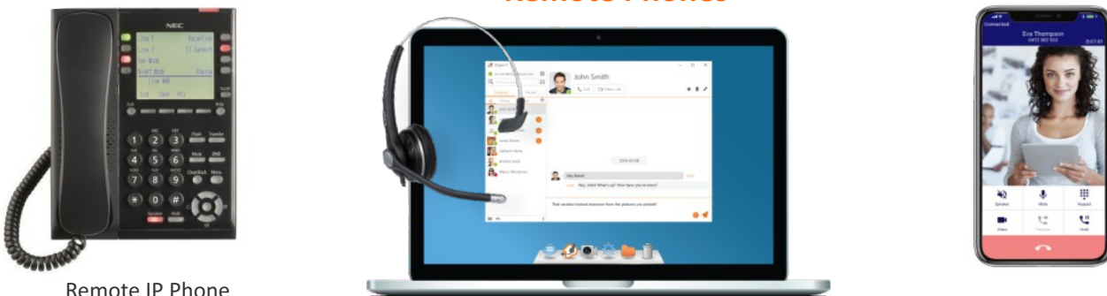
Remote IP Phone